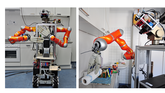
Fig. 2. The TUM Rosie robot that is controlled by the CRAM architecture presented in this work.